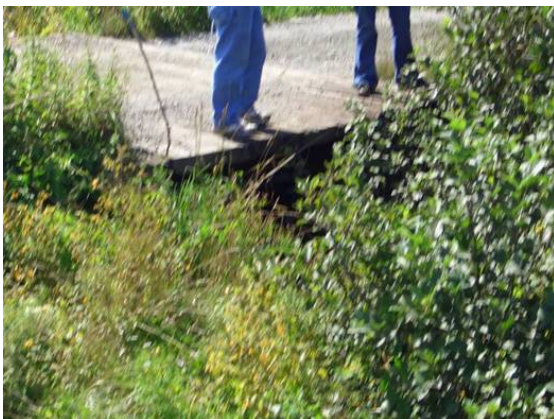
Figure 1. Upstream view of crossing