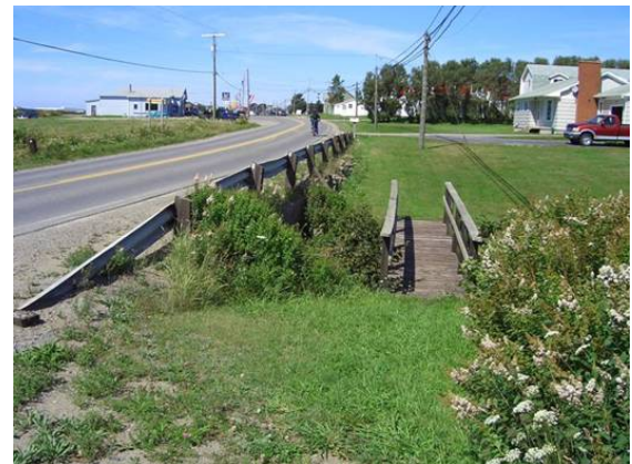
Figure 1. Downstream view of crossing.