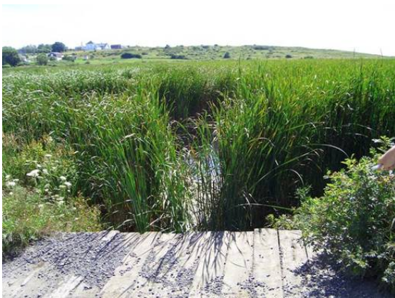
Figure 1. Downstream of crossing