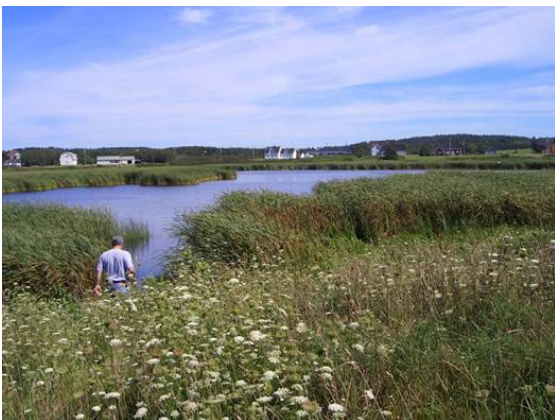
Figure 3. Upstream of crossing View of freshwater marsh system from the dyke.