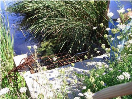
Figure 1. Upstream view of crossing