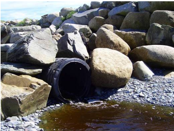
Figure 2. Downstream of crossing, culvert opens directing onto beach, covered by large boulders and a dyke.