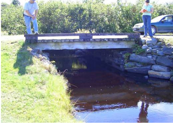
Figure 1. Downstream view of crossing, road leads to a residential driveway.