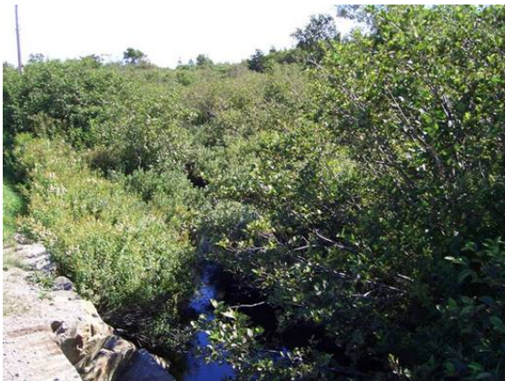
Figure 3. Upstream of crossing, forested