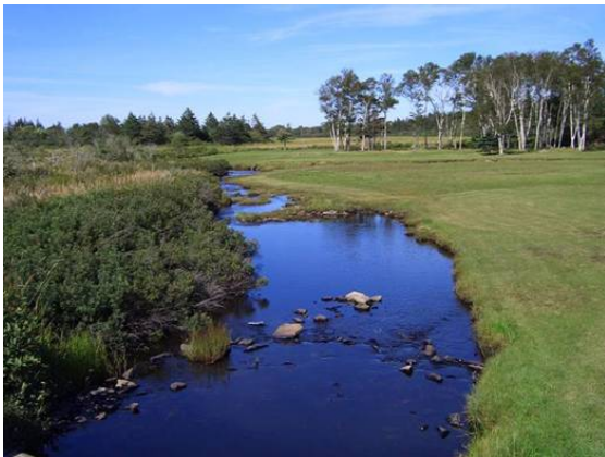
Figure 2. Downstream of crossing, yard borders river on north side.