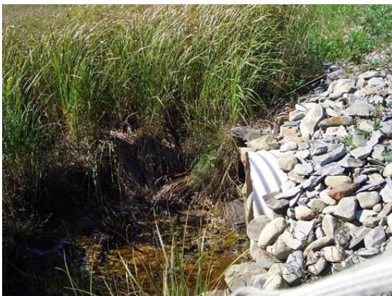
Figure 3. Upstream view of crossing