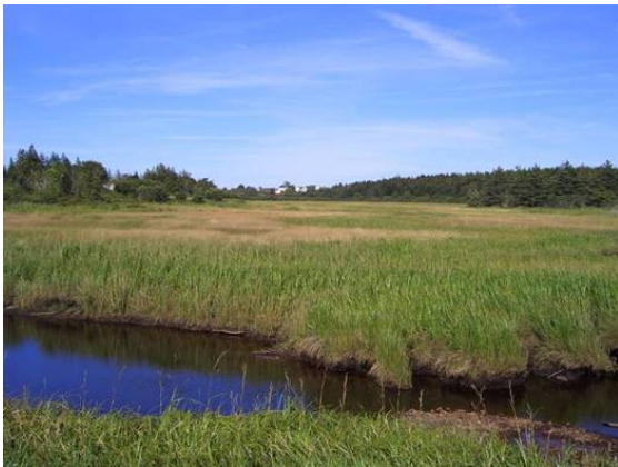
Figure 2. Downstream of crossing