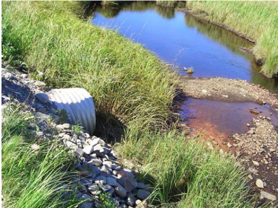
Figure 1. Downstream view of crossing