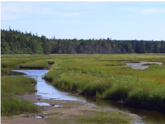
Figure 2. Upstream of crossing