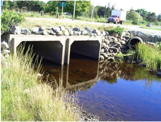
Figure 1. Downstream view of crossing