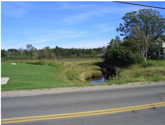
Figure 2. Upstream of crossing