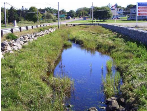
Figure 3. Looking towards the downstream side of crossing from DC29B.