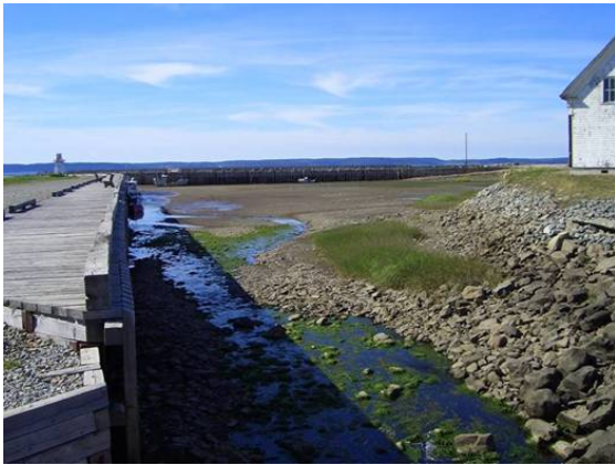
Figure 2. Upstream of crossing there is a small area between road and parking lot (ditch) leading to DC30C