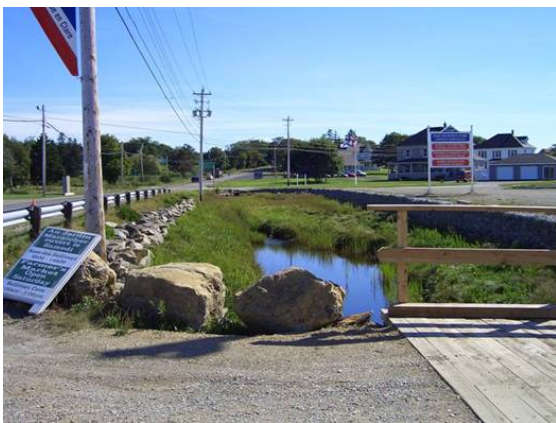
Figure 3. Downstream of crossing, harbour and jetty