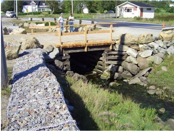
Figure 1. Upstream view of crossing