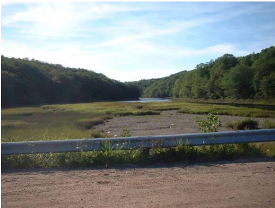
Figure 2. Downstream of crossing