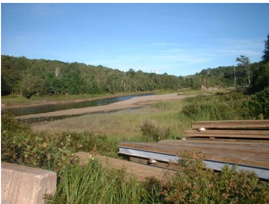
Figure 3. Upstream of crossing