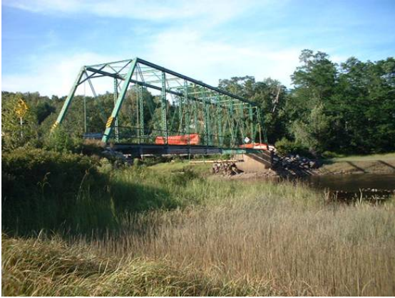
Figure 1. Upstream view of crossing