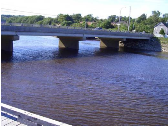
Figure 1. Upstream view of crossing.