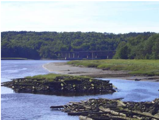
Figure 3. Downstream rail bridge and remnants of old wharf.