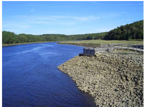
Figure 4. Upstream of crossing.