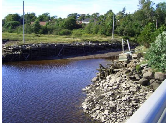
Figure 2. Downstream scour pool.