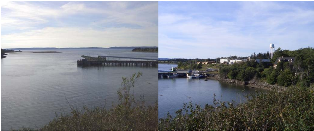
Figure 2. Downstream of crossing showing harbour and wharf.