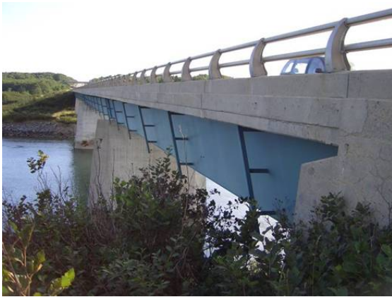
Figure 1. Upstream view of crossing