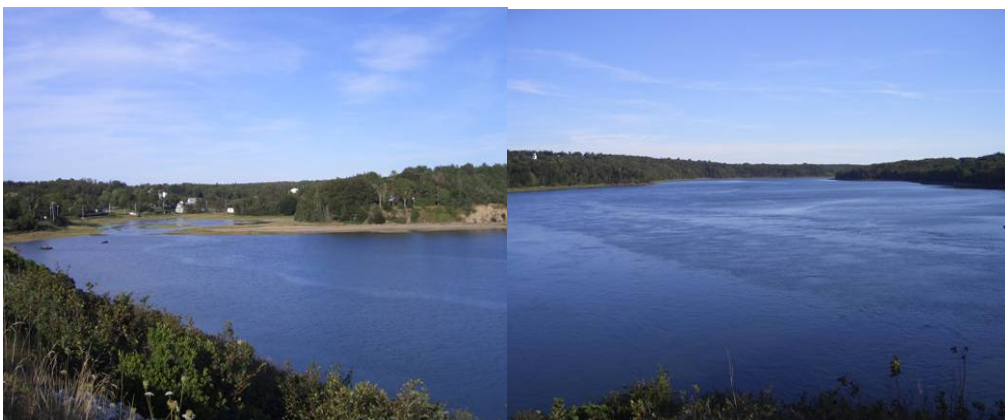
Figure 3. Upstream of crossing showing inlet with bordering residences.