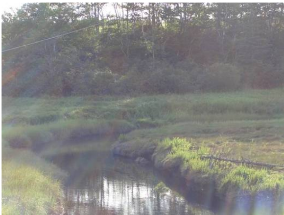
Figure 2. Downstream of crossing