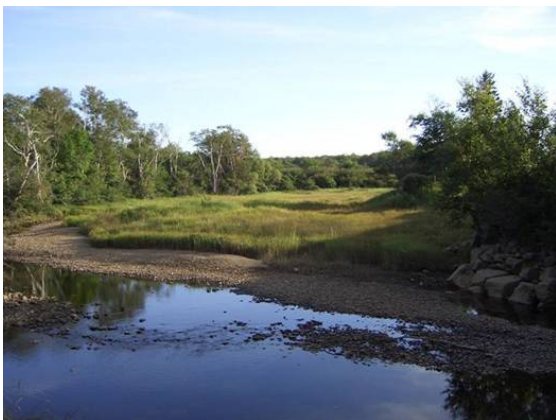
Figure 3. Upstream of crossing