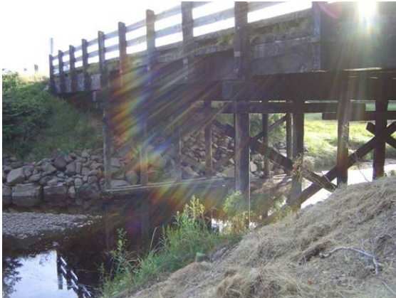
Figure 1. Upstream view of crossing