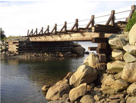
Figure 3. Upstream scour pool