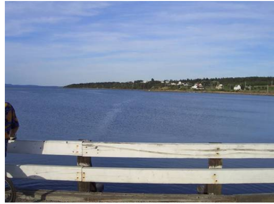
Figure 2. Upstream of Crossing