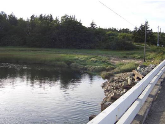
Figure 1. Upstream view of crossing