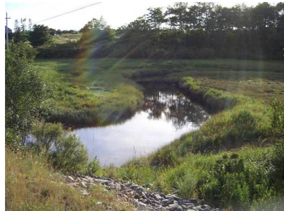
Figure 4. Downstream of crossing, opens into ocean