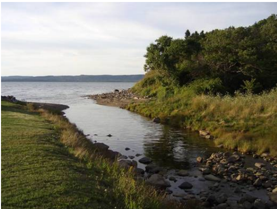
Figure 2. Downstream of crossing