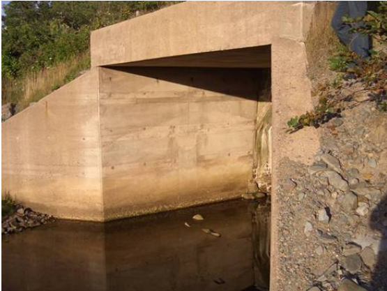
Figure 1. Downstream view of crossing