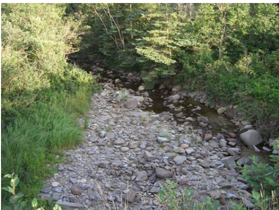
Figure 3. Upstream of crossing