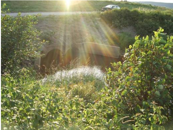
Figure 1. Upstream view of crossing