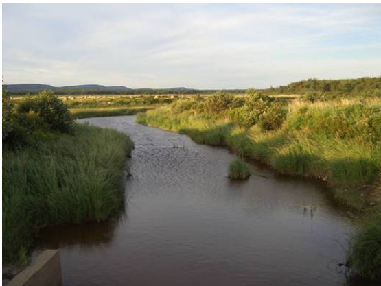
Figure 2. Upstream of crossing