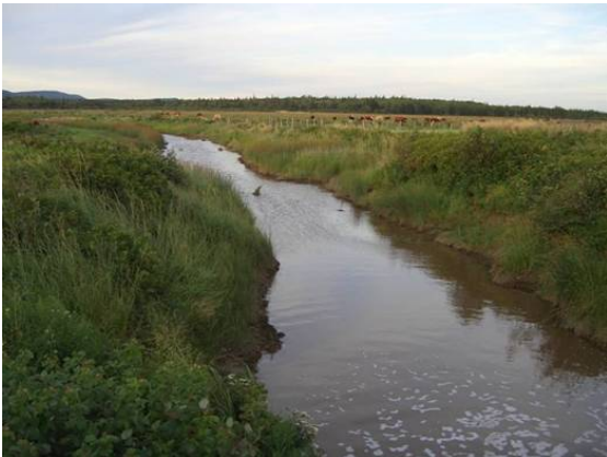
Figure 2. Upstream of crossing