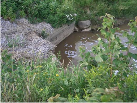
Figure 1. Upstream view of crossing