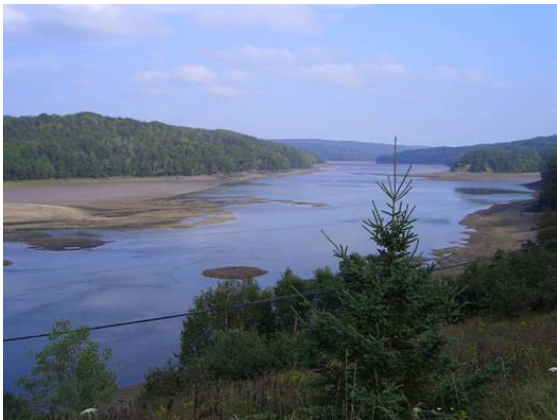
Figure 2. Upstream of crossing