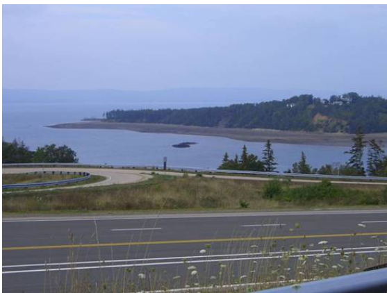
Figure 3. Downstream of crossing looking from off ramp on south side of river just past bridge.