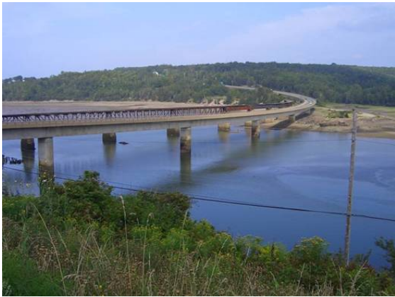
Figure 1. Upstream view of crossing