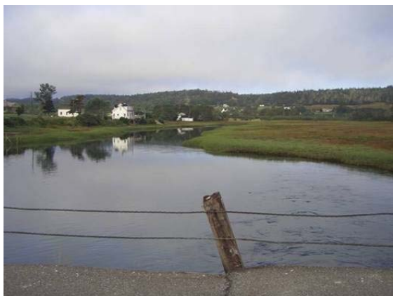
Figure 2. Upstream of crossing