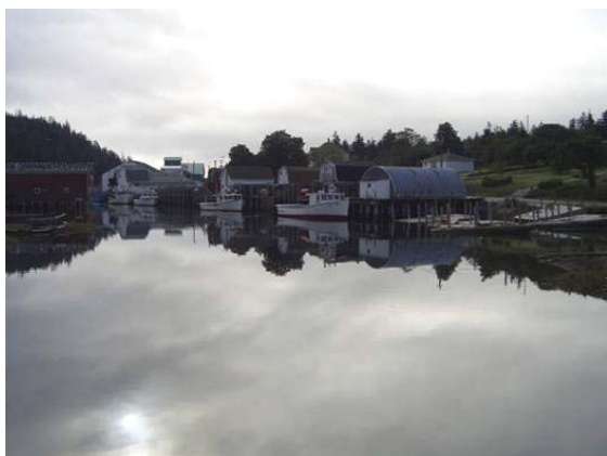
Figure 3. Downstream of crossing