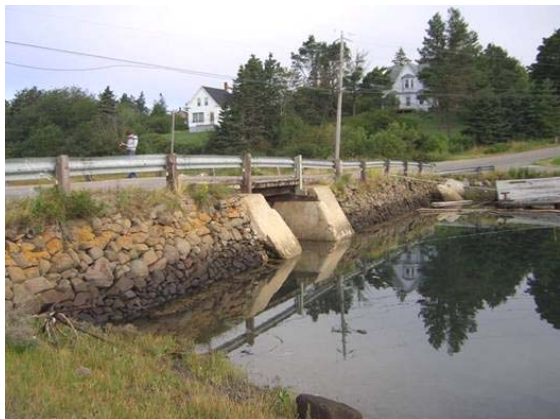
Figure 1. Downstream view of crossing