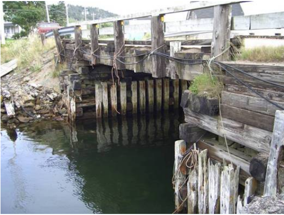
Figure 1. Upstream view of crossing