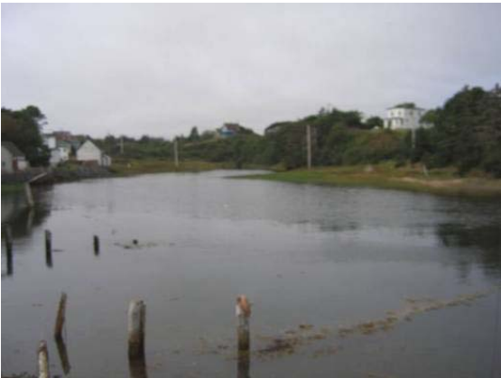
Figure 2. Upstream of crossing