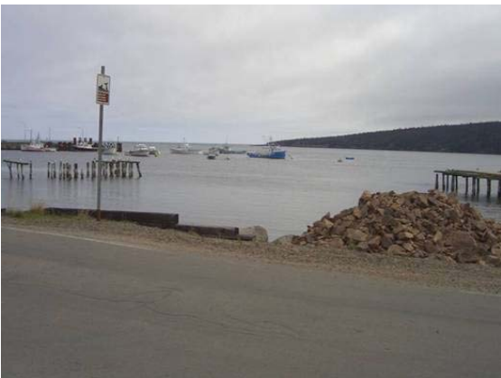
Figure 3. Downstream of crossing