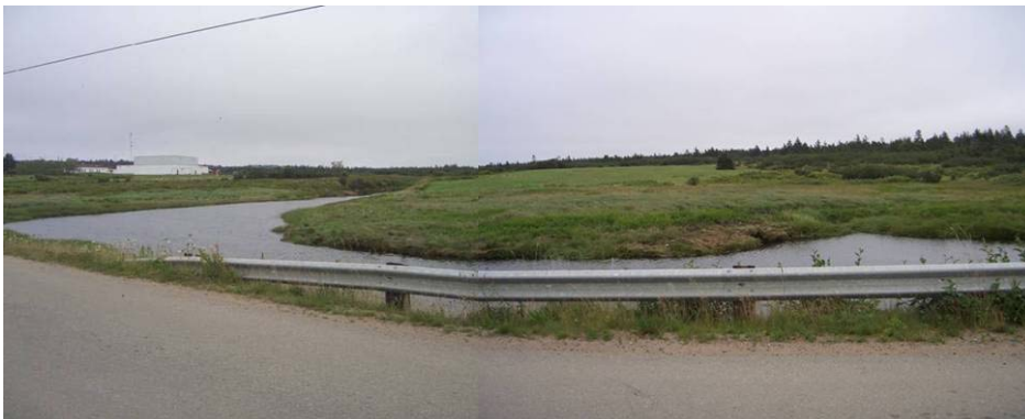
Figure 2. Upstream of crossing