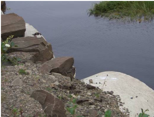
Figure 1. Upstream view of crossing