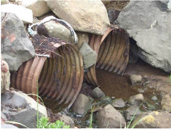
Figure 1. Downstream view of crossing. Culverts are old, rusted and collecting debris.