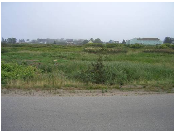
Figure 3. Upstream of crossing