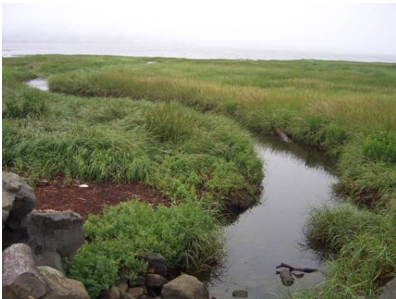
Figure 2. Downstream of crossing