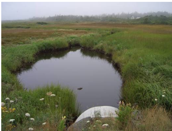
Figure 1. Upstream of crossing