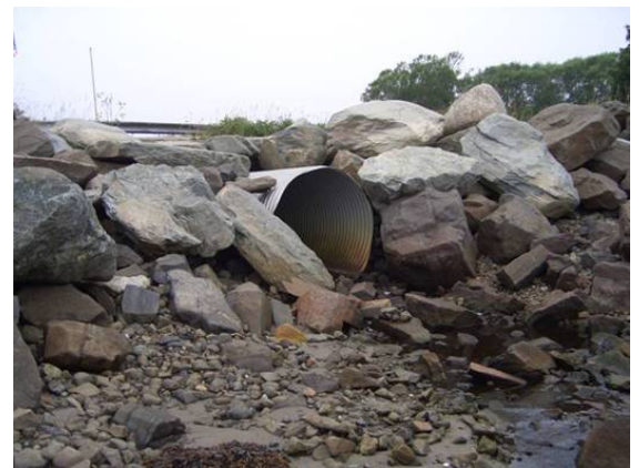
Figure 2. Downstream view of crossing