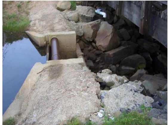
Figure 2. Upstream view of crossing