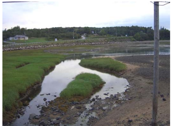
Figure 4. Downstream of crossing