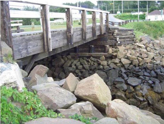
Figure 1. Downstream view of crossing