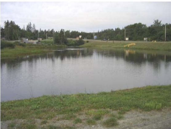
Figure 3. Upstream head pond