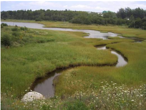
Figure 2. Downstream of crossing