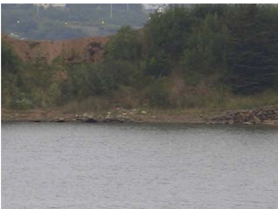
Figure 3. Further downstream of crossing there is a causeway separating this area from the Basin. Could not access this barrier or assess any culvert(s) underneath it.