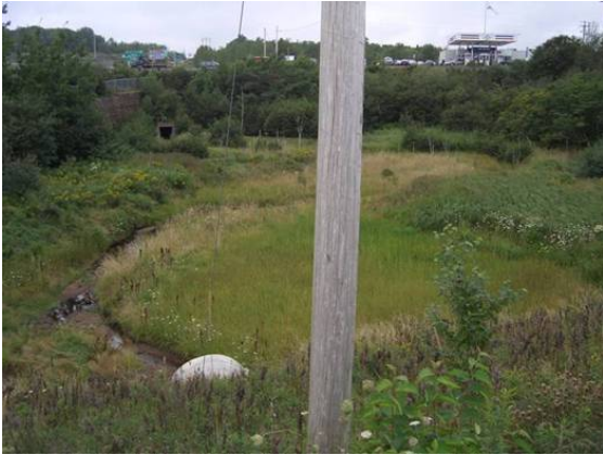
Figure 1. Upstream of crossing there is a square culvert passing under Hwy 303.