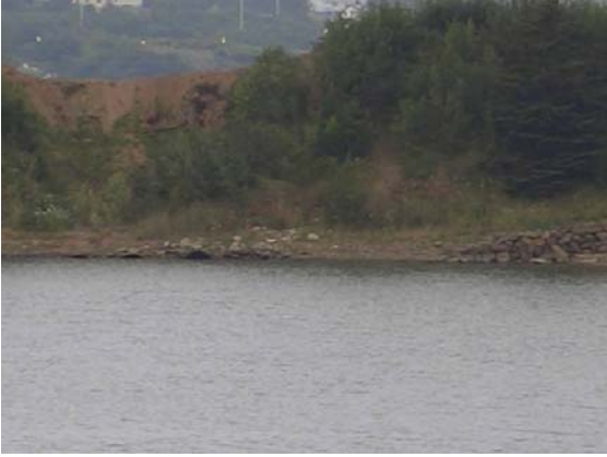
Figure 1. Downstream of crossing. This channel joins the larger creek.