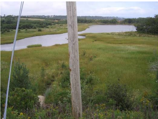
Figure 2. Further downstream of crossing there is a causeway separating this area from the Basin. Could not access this barrier or assess any culvert(s) underneath is.