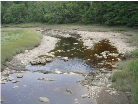
Figure 2. Downstream of crossing