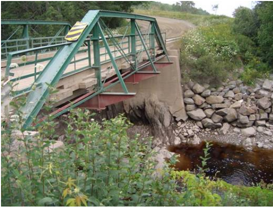
Figure 1. Downstream view of crossing