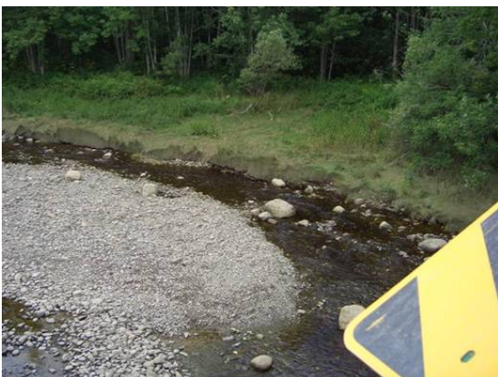
Figure 3. Upstream of crossing