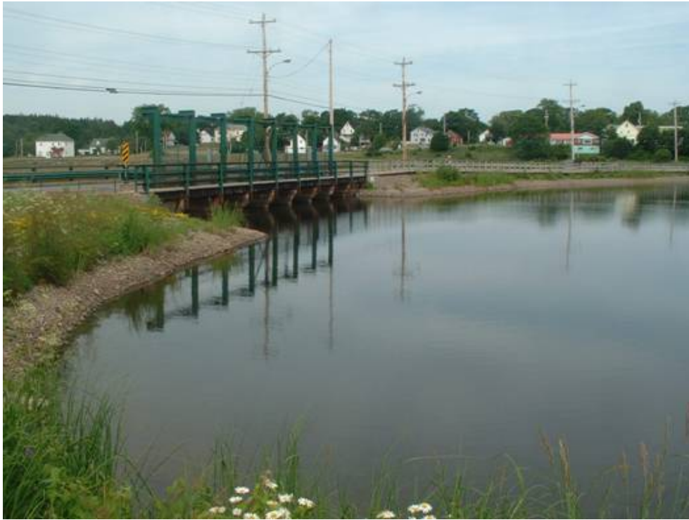
Figure 2. Upstream of causeway and dam structure with head pond.