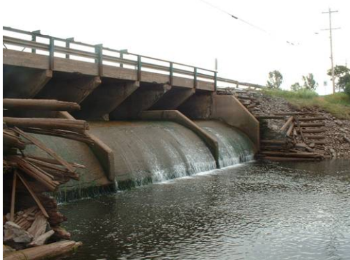
Figure 1. Downstream view of the structure.