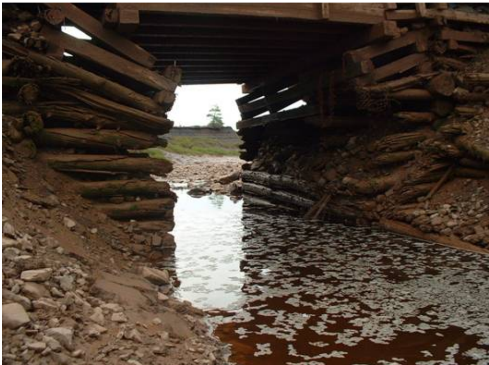
Figure 2. Upstream looking down under bridge. The old bridge is pinching the river channel.