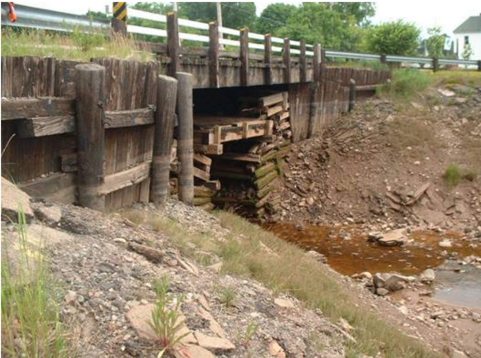
Figure 1. Downstream view of the bridge with the old structure visible under bridge.