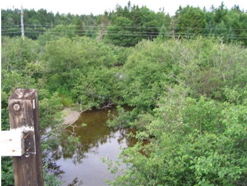
Figure 2. Upstream view from crossing, largely wooded area.