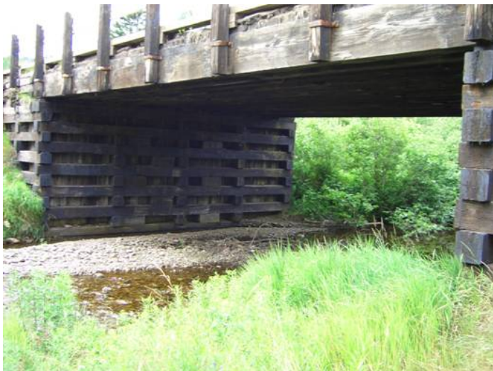
Figure 1. Downstream view of the bridge