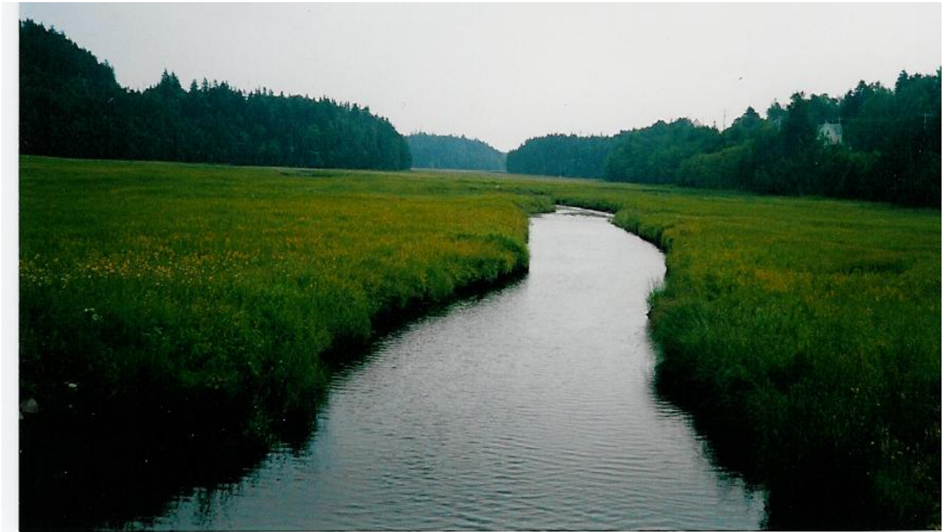
Figure 2. Downstream of crossing. Creek with salt marsh on either side.