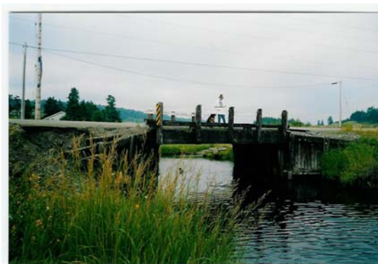
Figure 1. Downstream of crossing. The structure is slightly pinching the creek but does not appear to be significantly adversely affecting hydrology or habitat.