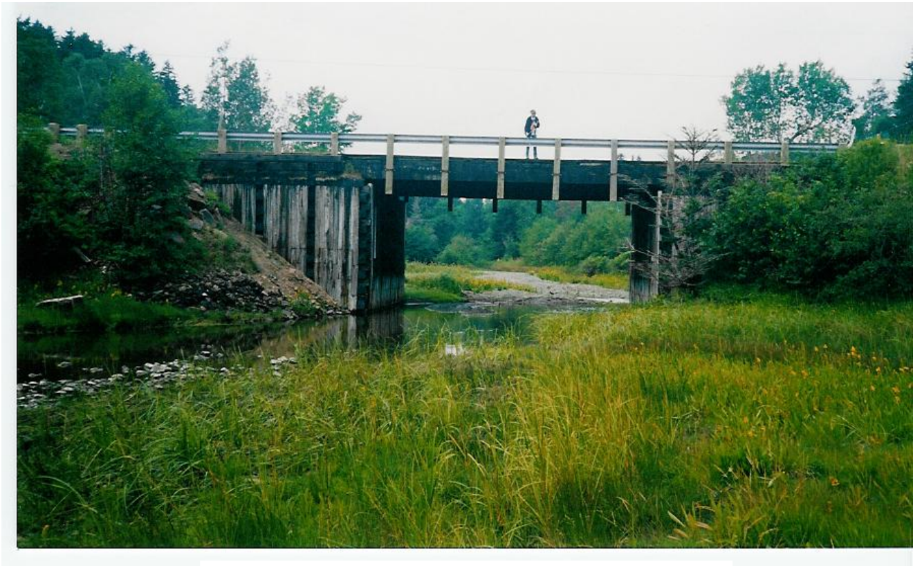
Figure 2. Closer downstream view of the crossing.