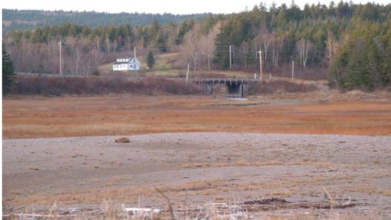
Figure 1. The crossing as seen from the downstream beach.