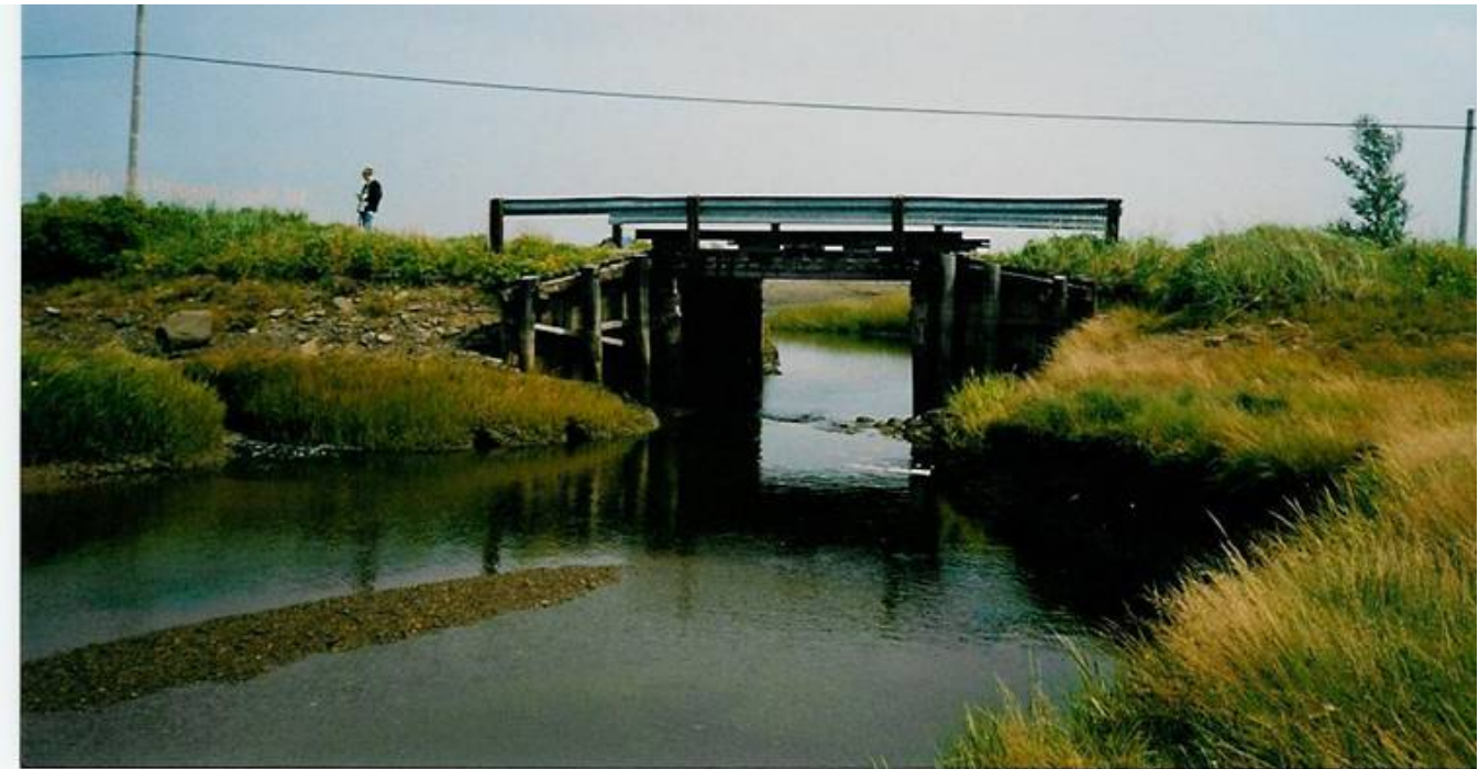
Figure 1. Upstream of the crossing with lots of salt marsh vegetation.