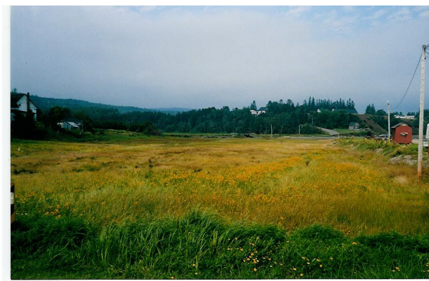
Figure 2. Downstream marsh with the campground to the right that is located along open edge of barrier beach.