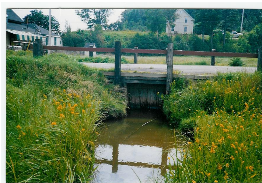
Figure 1. Downstream end of the crossing. The broken gate is visible. It is allowing some tidal flow, but should be removed to eliminate the small amount of pooling.