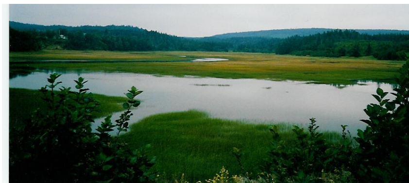
Figure 1. Marsh and creek upstream of the crossing.