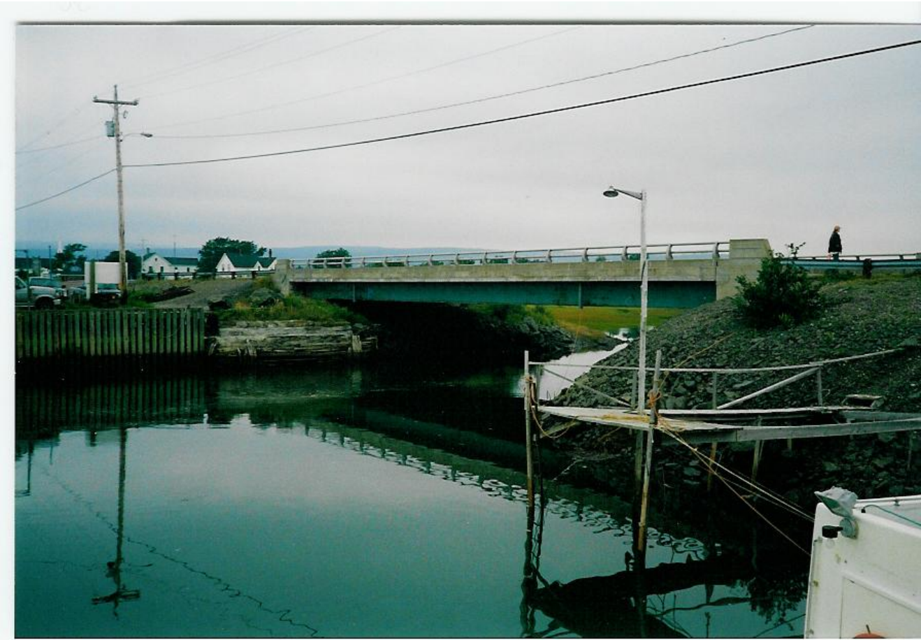
Figure 2. Downstream of the crossing that also shows elements of the working waterfront.