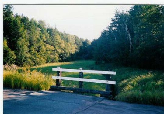
Figure 1. Upstream of the crossing. There are cracks in the road, and the railing is tilting over.