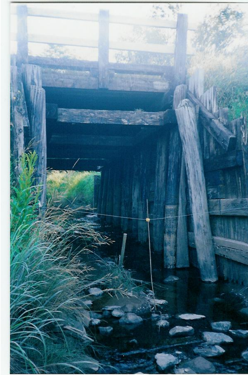
Figure 2. Under the bridge from the downstream side of the crossing. There is fencing across the creek at the bridge. Very few salt vegetation species.