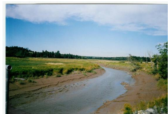
Figure 2. Downstream of the bridge, taken from the bridge.