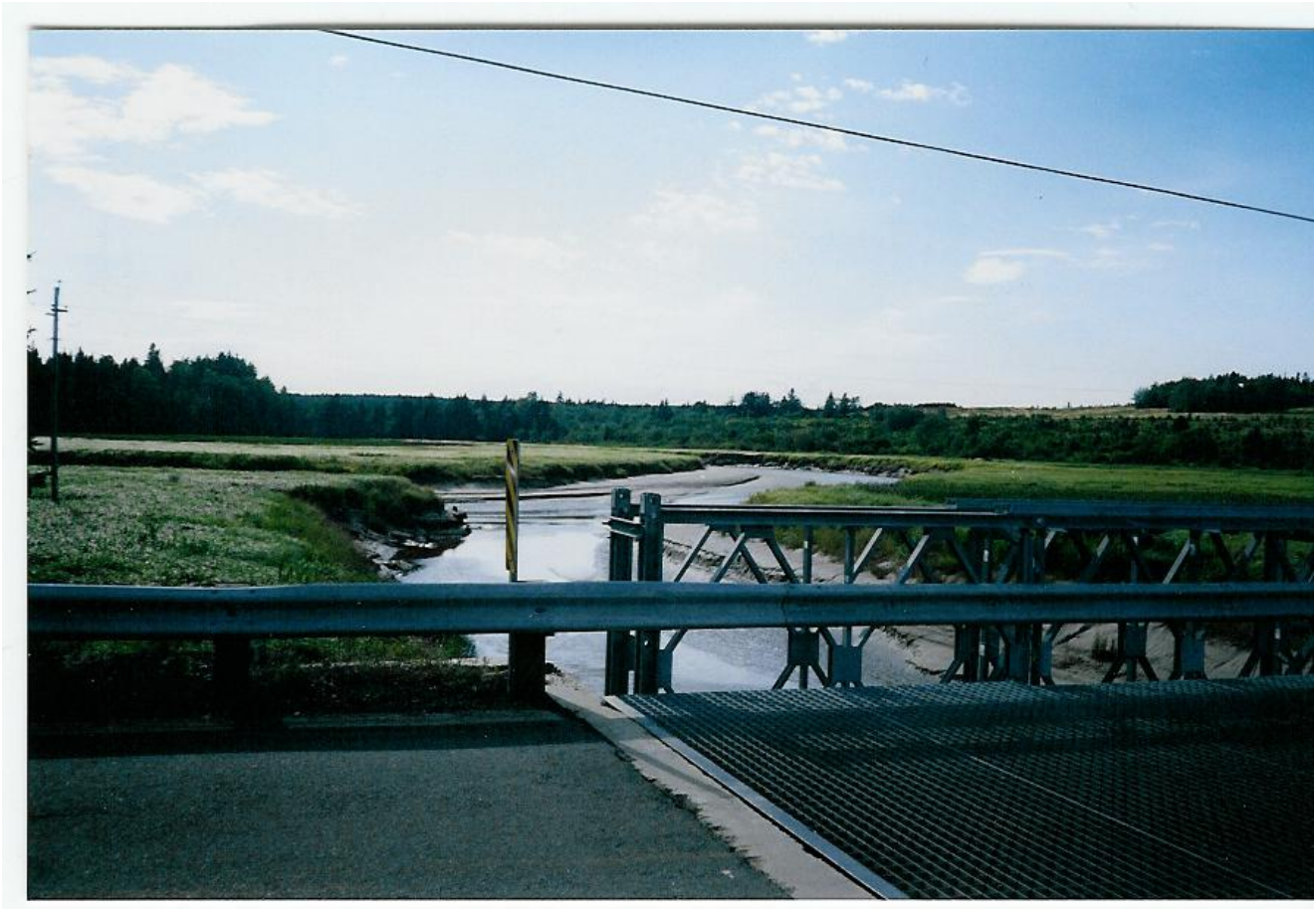
Figure 3. Upstream of the bridge.