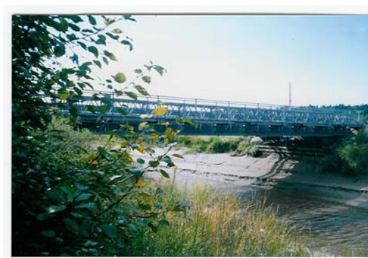
Figure 1. Non restrictive, one lane bridge. Photo taken from upstream bank.