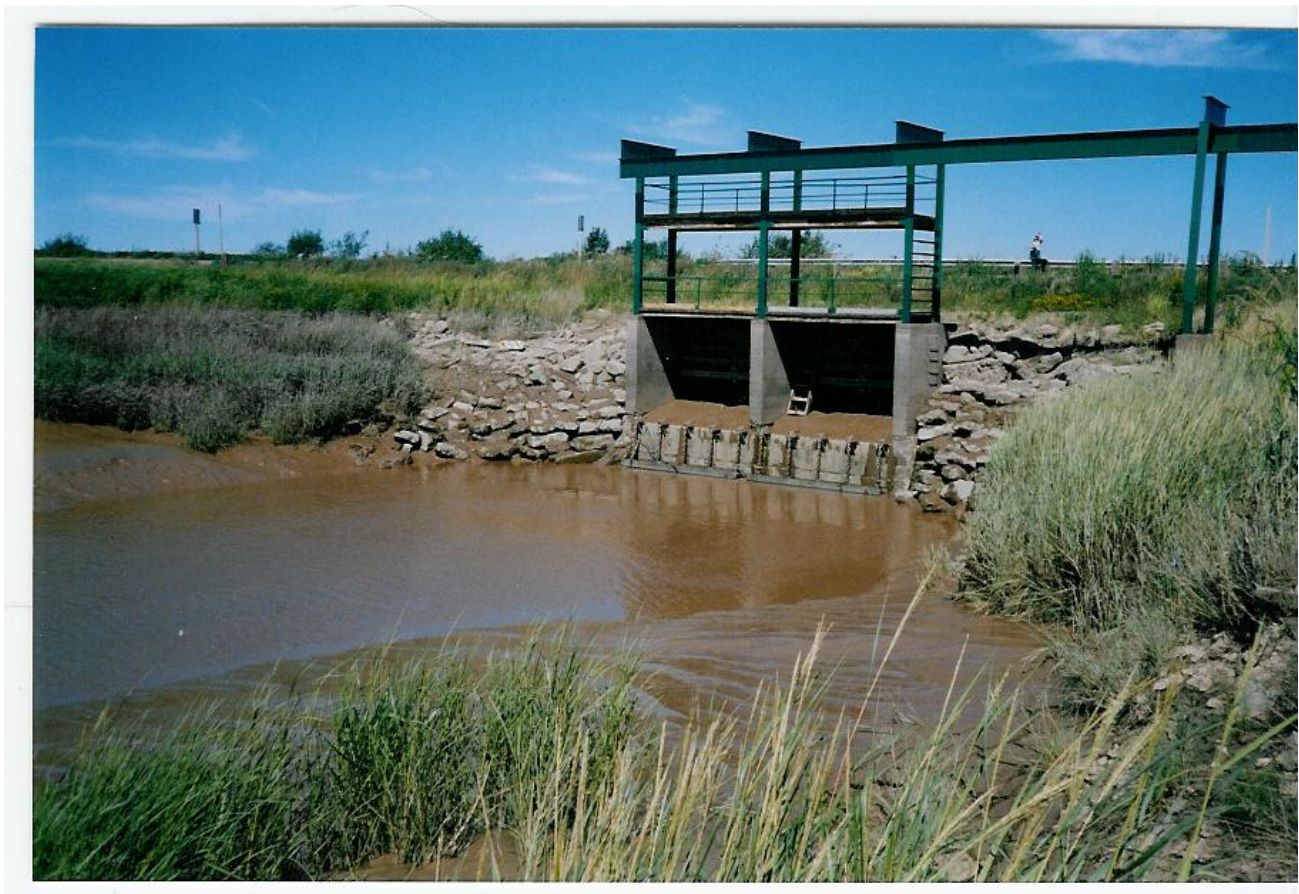
Figure 2. Downstream of crossing.