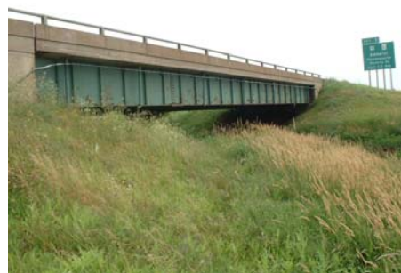
Figure 2. The bridge as seen from the upstream bank.