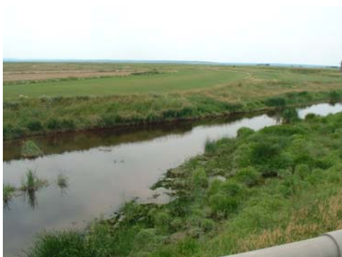
Figure 1. Downstream of the crossing is being actively farmed and is no longer tidal.

Comments: When repair or replacement is necessary, maintain the size of the opening. If obstructions downstream are removed, a new assessment of the crossing should be done. Evaluate land use and downstream obstructions for potential remediation or removal.