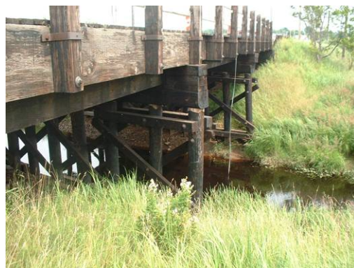
Figure 2. The road bridge.