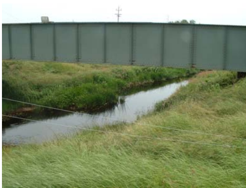
Figure 1. The rail bridge as seen from the road.