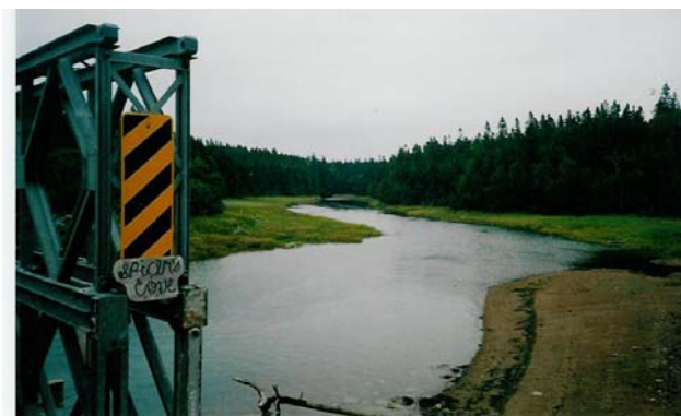
Figure 1. Upstream of the bridge. Small amount of beach to one side and the rest is salt marsh.