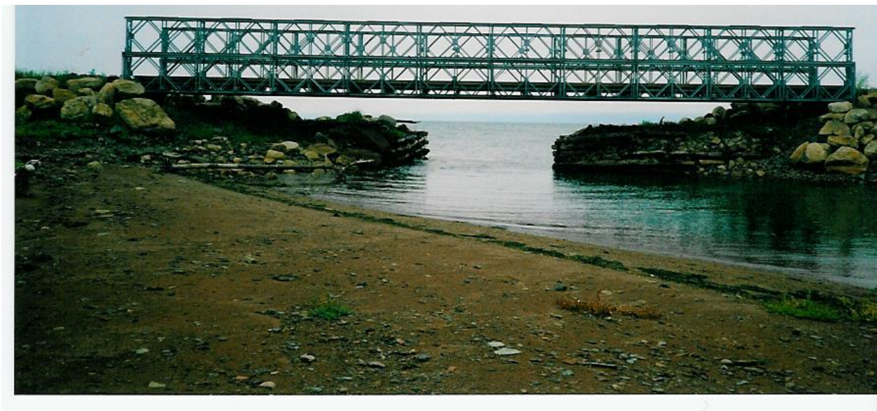
Figure 3. The bridge from the upstream beach clearly showing the pinching of the river by the bank support structures.