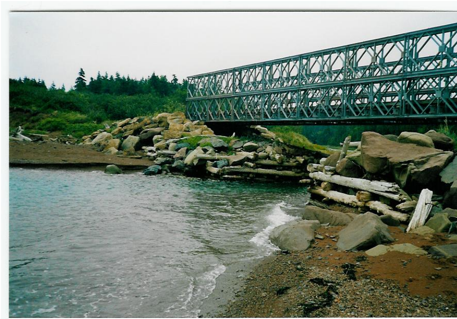
Figure 2. Downstream view of the bridge showing the boulders and remnant material from old crossing.