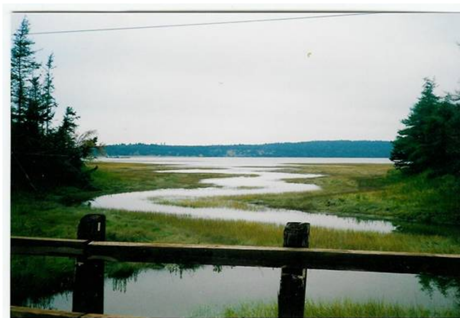
Figure 3. Downstream of crossing approaching high tide.