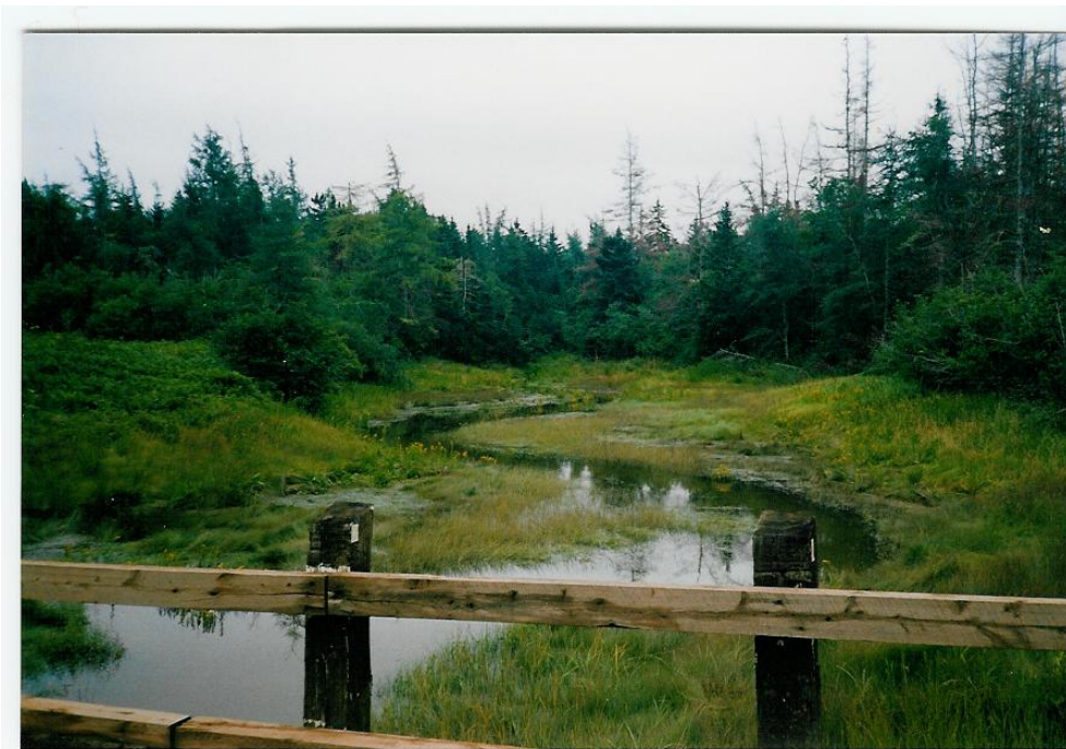
Figure 2. Upstream of the crossing approaching high tide.