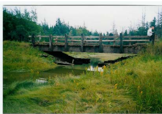
Figure 1. Downstream of the crossing. The old structure under the bridge is visible.