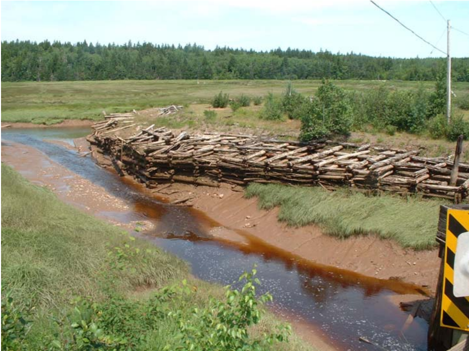
Figure 2. Old wooden structure downstream of the bridge, possibly an old wharf. DU impoundment off to the right