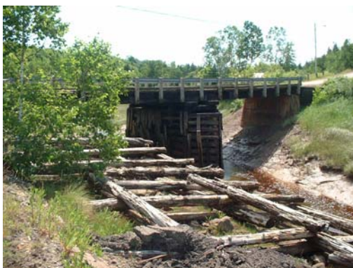
Figure 1. Downstream of the crossing with the large wooden structure on one of the banks and the large wooden support structure under the bridge.