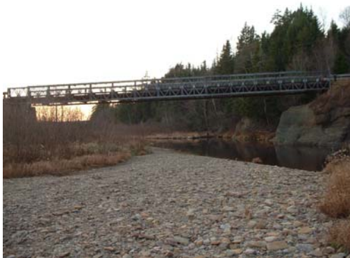
Figure 1. Upstream of bridge.