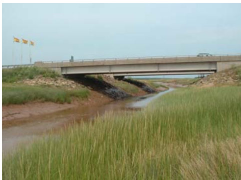
Figure 1. The bridge from a downstream bank.