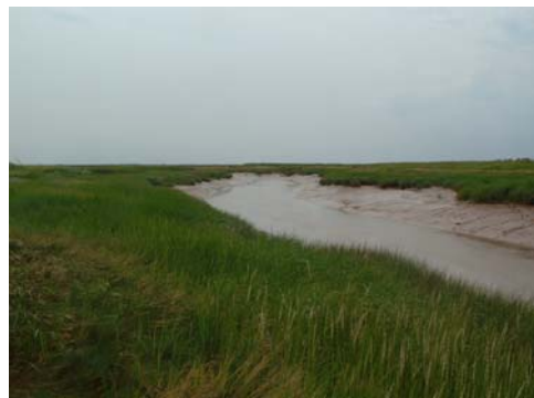
Figure 2. Downstream of the bridge.