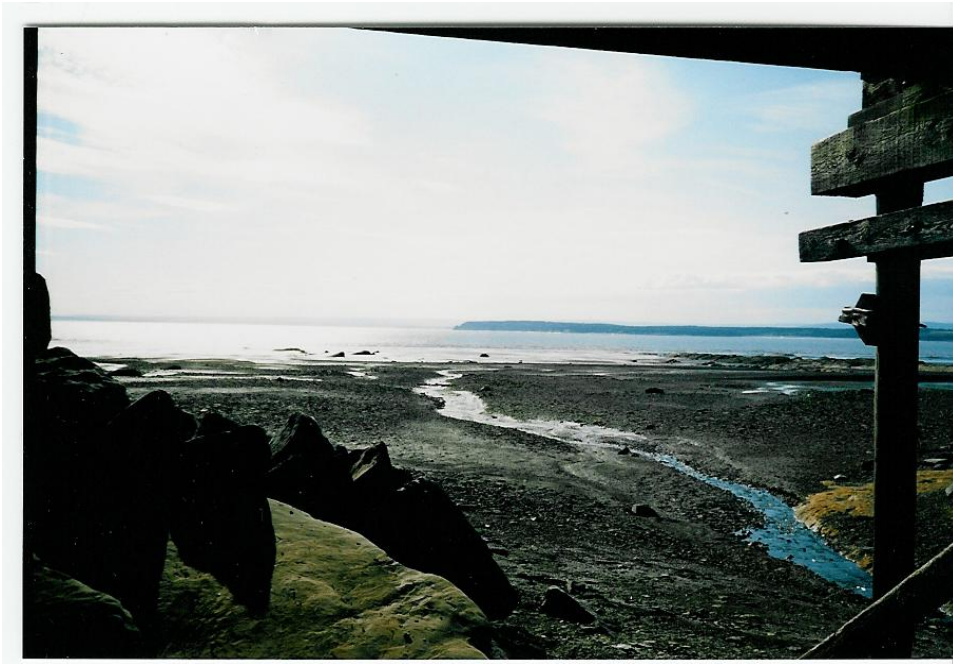
Figure 2. Downstream from under the bridge.