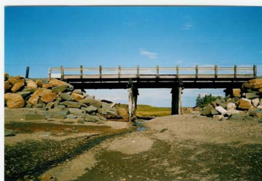
Figure 1. Downstream of the bridge on the beach.