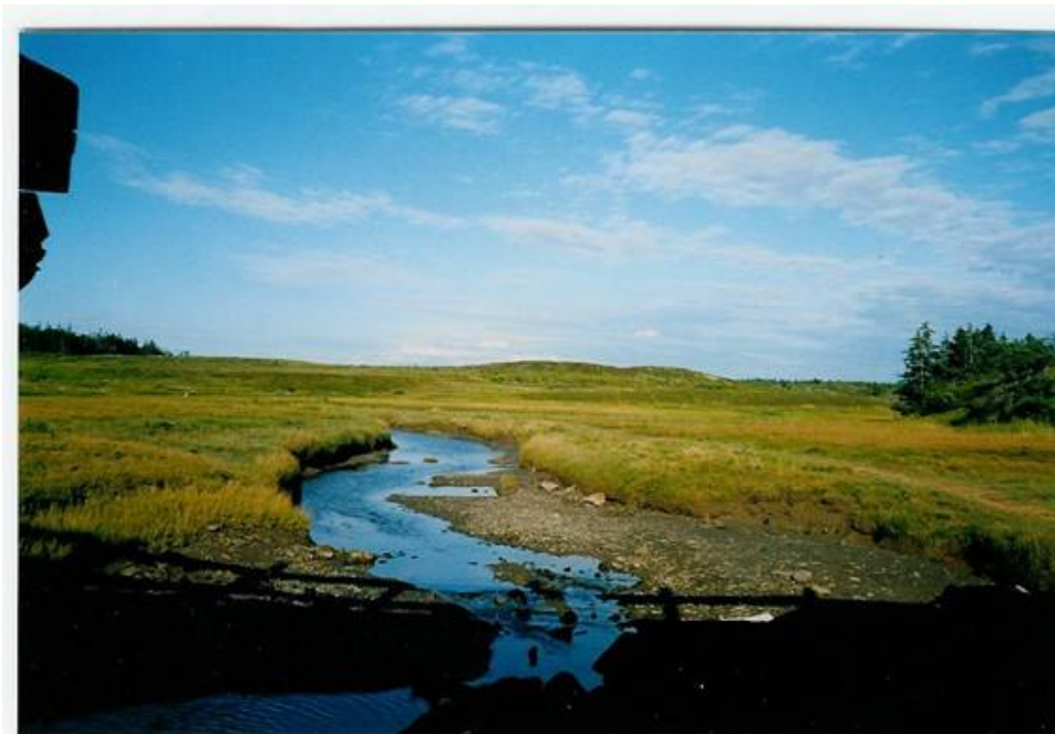
Figure 3. Upstream creek and salt marsh. The hill in the background is where the blueberry fields begin.