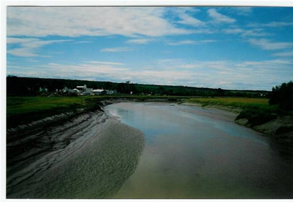
Figure 2. The river downstream from standing on the bridge.