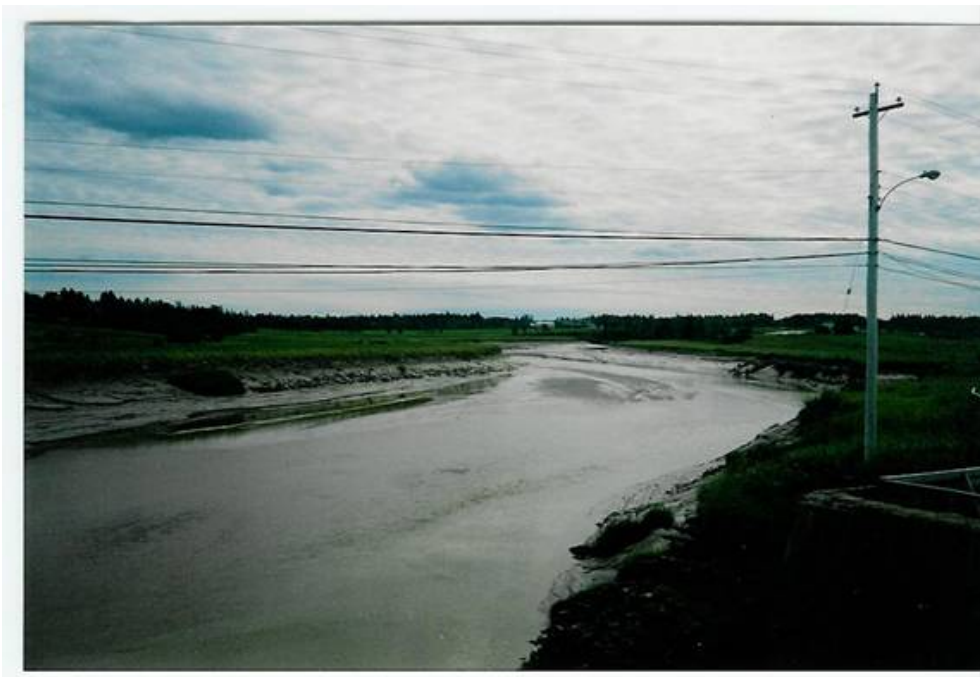
Figure 3. The river upstream from standing on the bridge.