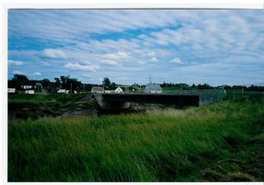
Figure 1. Bridge seen from the downstream side.