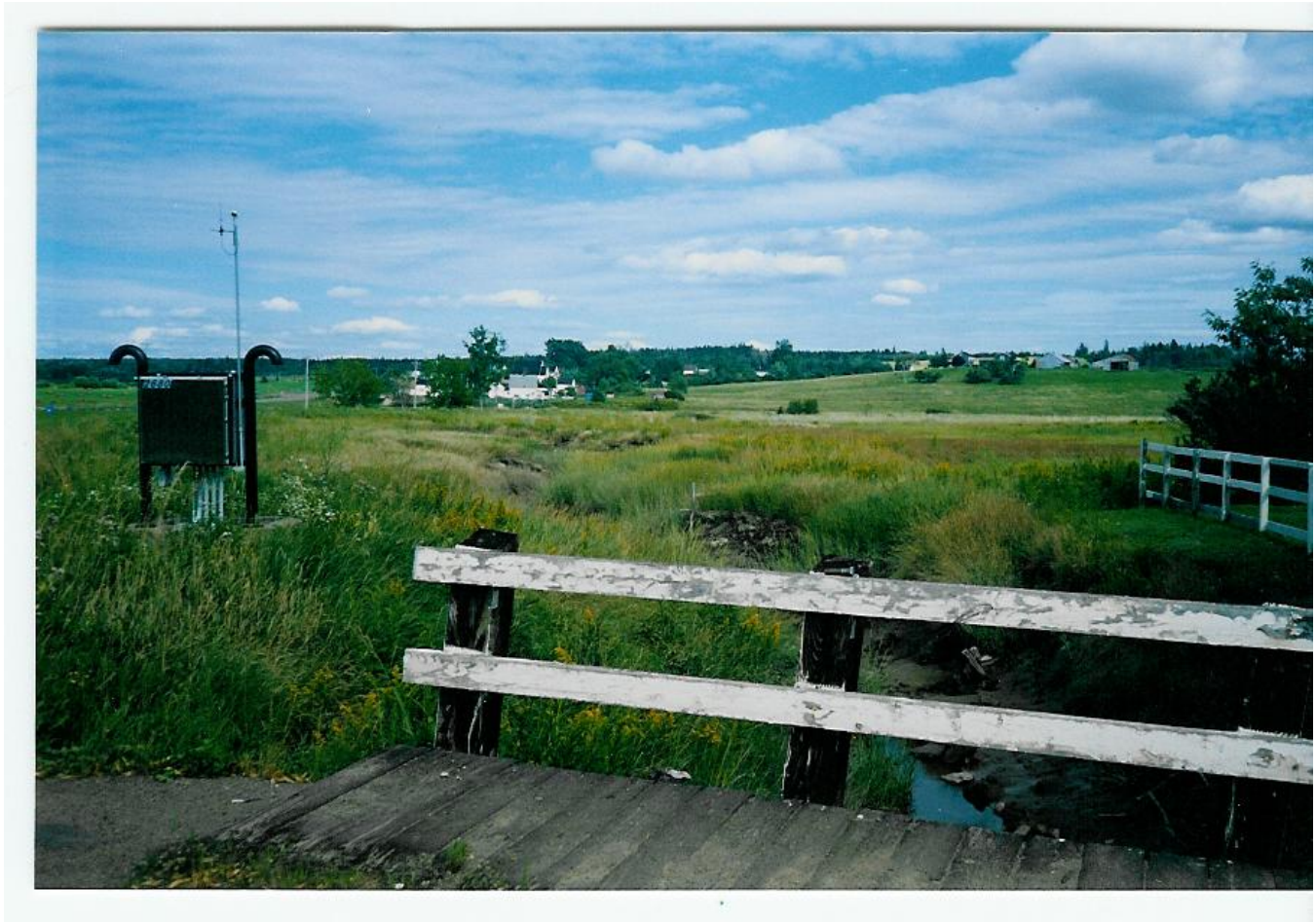
Figure 2. Looking downstream from the road.