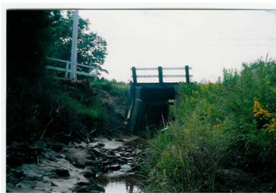
Figure 1. Downstream of the bridge. There are steep banks on either side of the creek, with a house near the right bank.