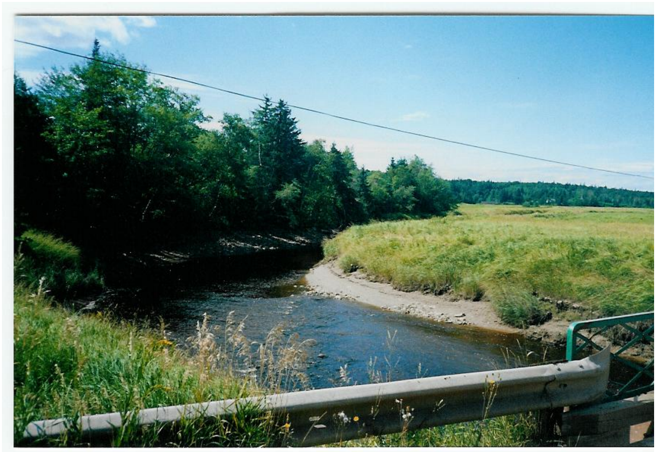
Figure 2. Downstream view of creek from the road.