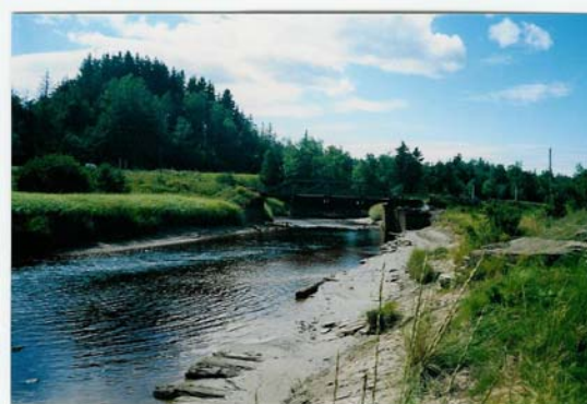
Figure 1. Downstream of non restrictive bridge.