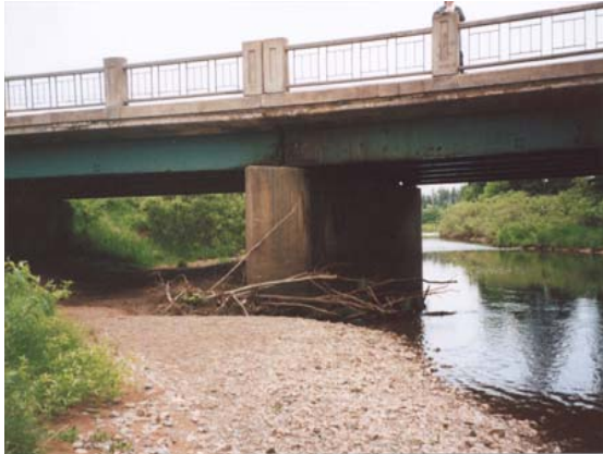
Figure 1. Upstream view of debris built up at site.